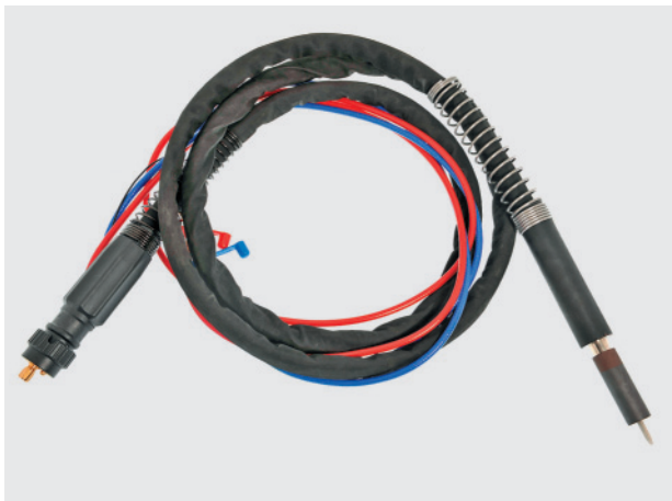
OT 500 WHD

In combination with the special designed Spade Tips both torches can reach a gap depth up to 2.13 inch and are suited for a perfect root weld quality. Because of their robust workmanship this torches can be used either in onshore- or offshore applications.