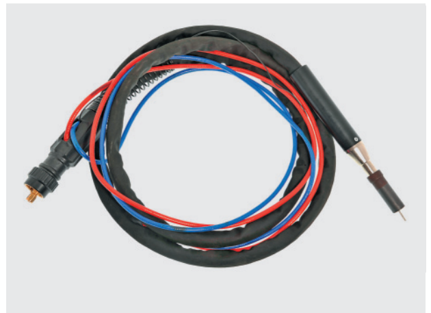
OT 500 W

spa automatic welding torches offers following advantages: